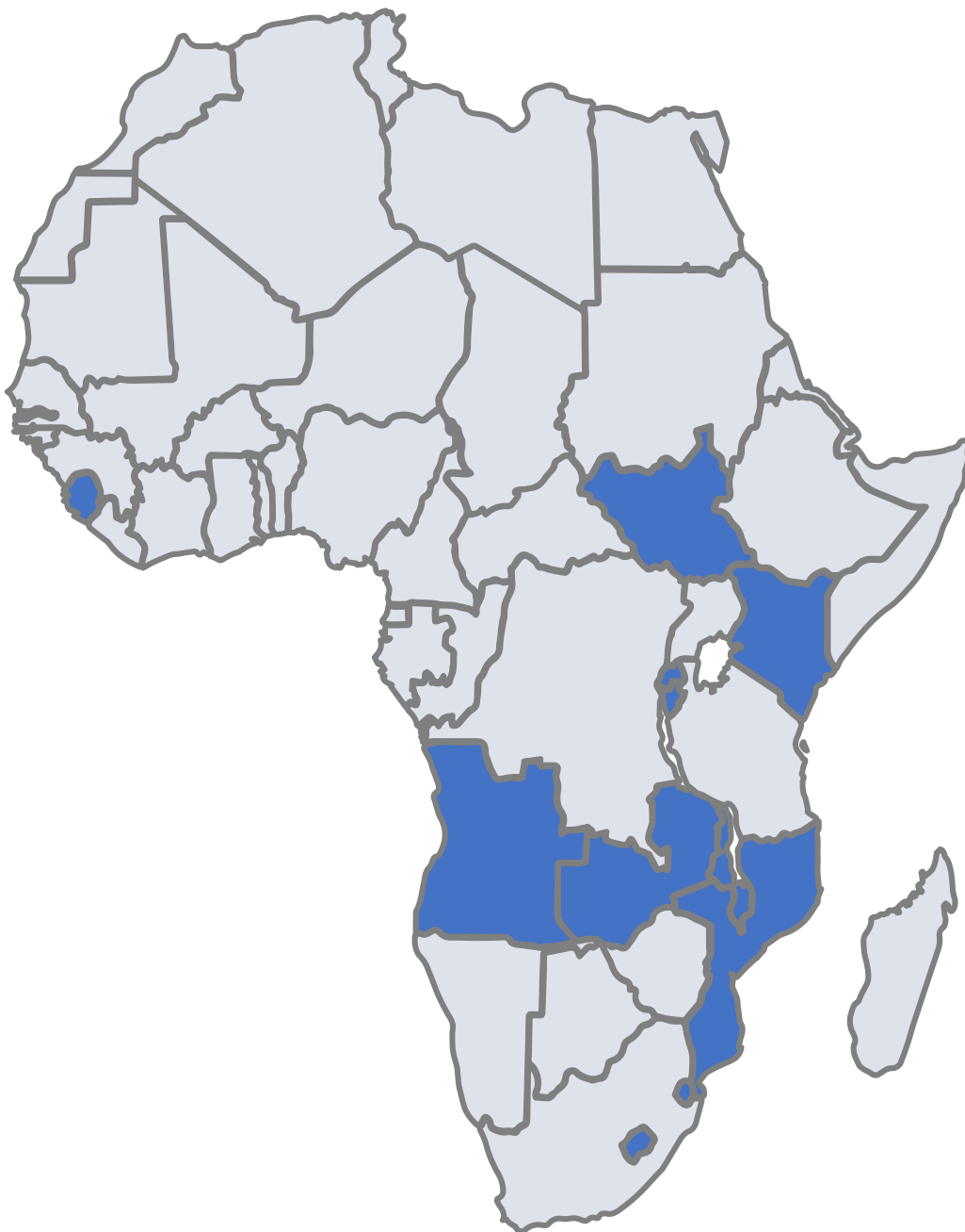
Fig. 1 Country training locations

All countries targeted frontline HCW, mainly clinical staff and public health practitioners working in health